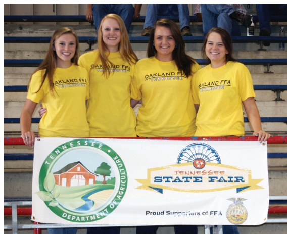
FFA chapters from across Tennessee participated in the Tennessee State Fair. On the left is the DeKalb County FFA Chapter who led Barn Tours. On the right is the Oakland FFA Chapter who competed in Career Development Events.