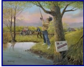
Farm Bureau 2012 - "The Farm Pond"