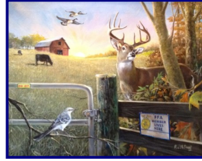
Tennessee Farmers Cooperative 2015 - "The Rising Sun"