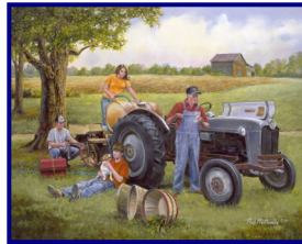
2009—"A Fading Era"