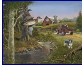
Farm Credit 2013 - "Going Home"