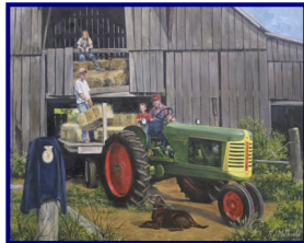
2008—"The Ol' Barn"