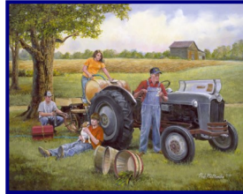
2009—"A Fading Era"